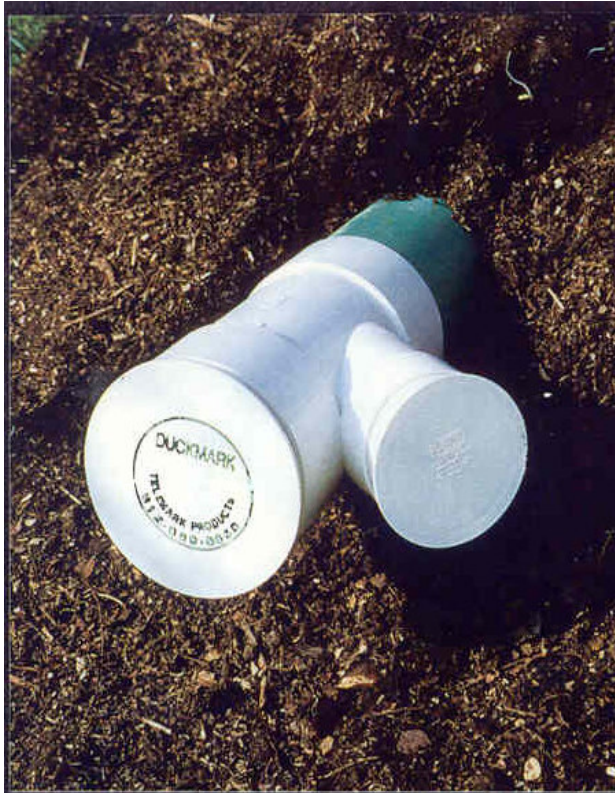
Locate Service Wye's