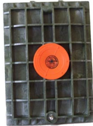
Pinpoint Buried Hand Holes

THE TELEMARK ELECTRONIC MARKER A Unique Product for Quick and Accurate Locating of Hand Holes, Vaults and Boxes.